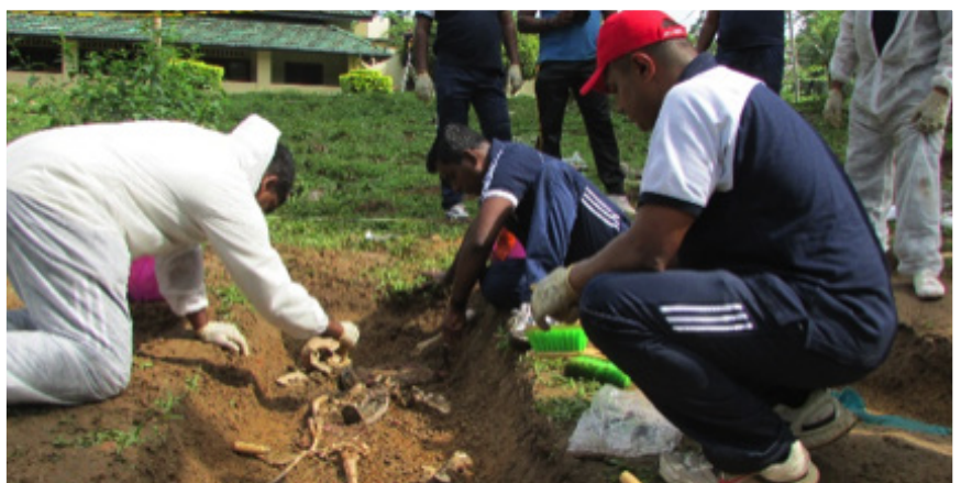
ICRC 1st Workshop in Forensic Archaeology, Anuradhapura and Kalutara (Sri Lanka) November 2016